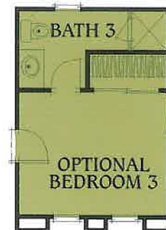
OPTIONAL BEDROOM 3 WITH BATH 3

All information is subject to change without notice. The plans for the Skyborne community are preliminary in nature and are subject to the approval of the applicable governmental agencies. All homes, products and features are subject to availability and applicable laws and other restrictions.