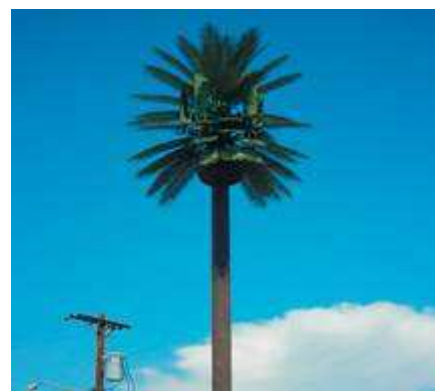
Figure 2: Palm Tree