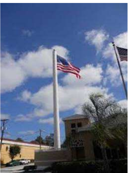
Figure 5: Flag Pole