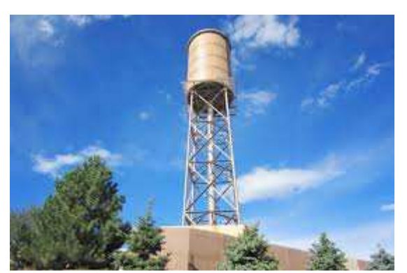
Figure 4: Water Tank