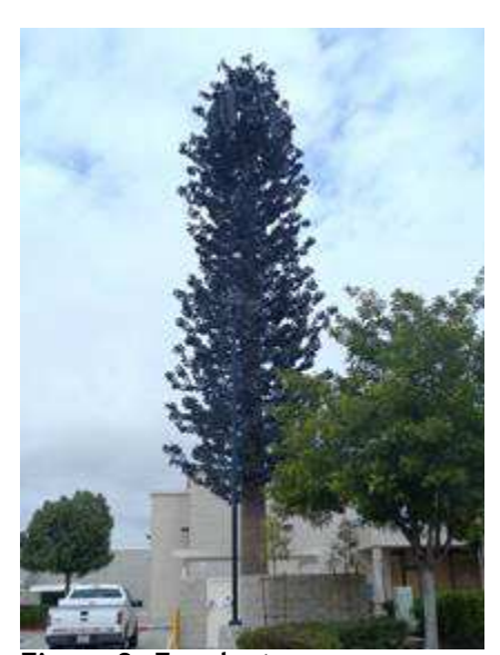
Figure 3: Eucalyptus