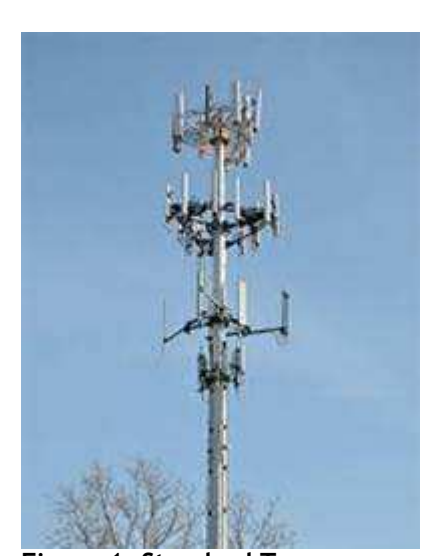
Figure 1: Standard Tower

Staff would like to be able to direct potential applicants on what the Planning Commission is looking for to make the necessary findings to approve new cell towers. Although the findings are specific to each request and property, staff is requesting discussion and consensus among the Planning Commission regarding design and camouflage options. Below are examples of types of towers for discussion.