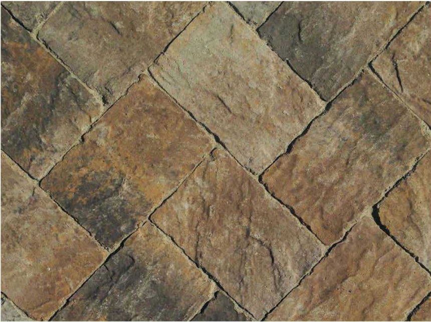
ENHANCED PAVING AT THROUGH OUT SITE MANUFACTURER: CALSTONE PRODUCT LINE: PERMEABLE QUARRY STONE COLOR: OAK BARREL GREEN