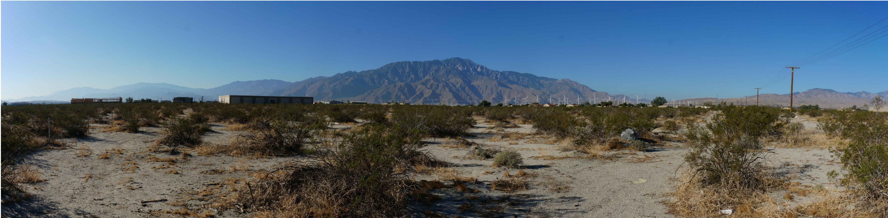
PHOTOGRAPH NO. 2 NORTH EAST CORNER