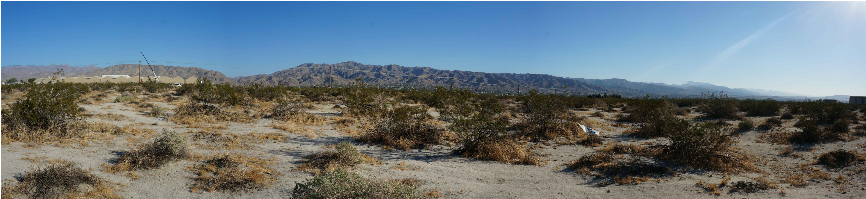
PHOTOGRAPH NO. 4 SOUTH WEST CORNER