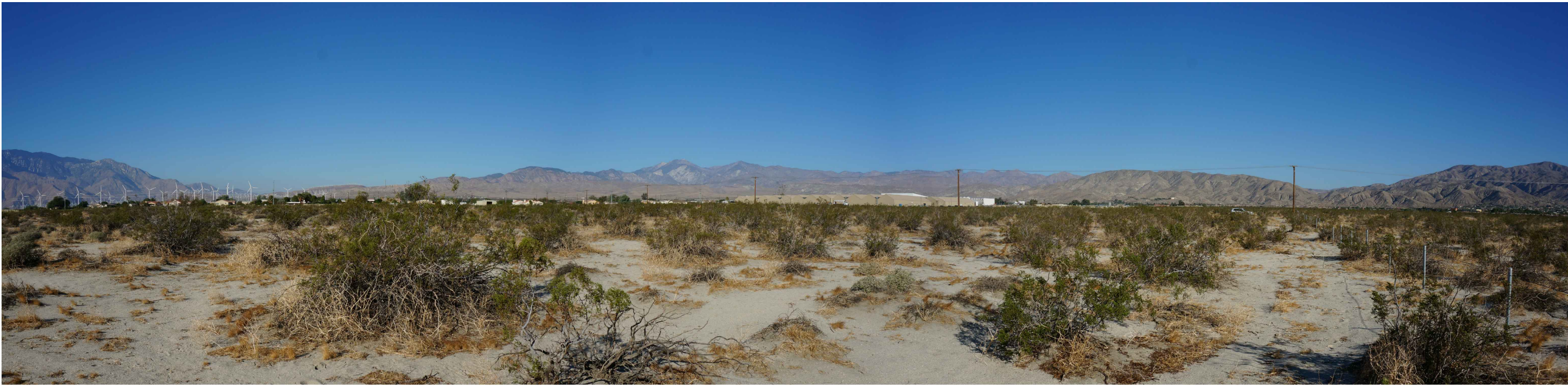
PHOTOGRAPH NO. 3 SOUTH EAST CORNER