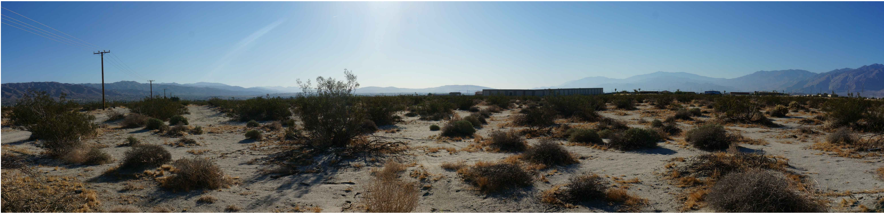
PHOTOGRAPH NO. 1 NORTH WEST CORNER