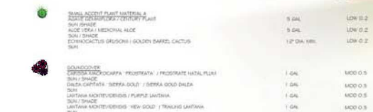
TYPICAL STANDARD (IRRIGATION)