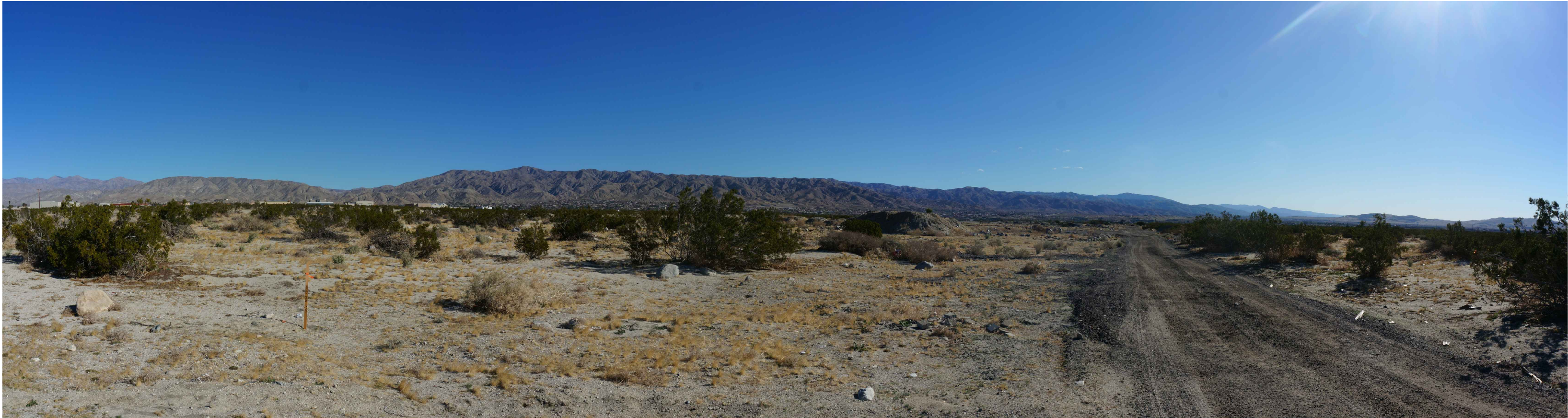
PHOTOGRAPH NO. 1 SOUTH WEST CORNER