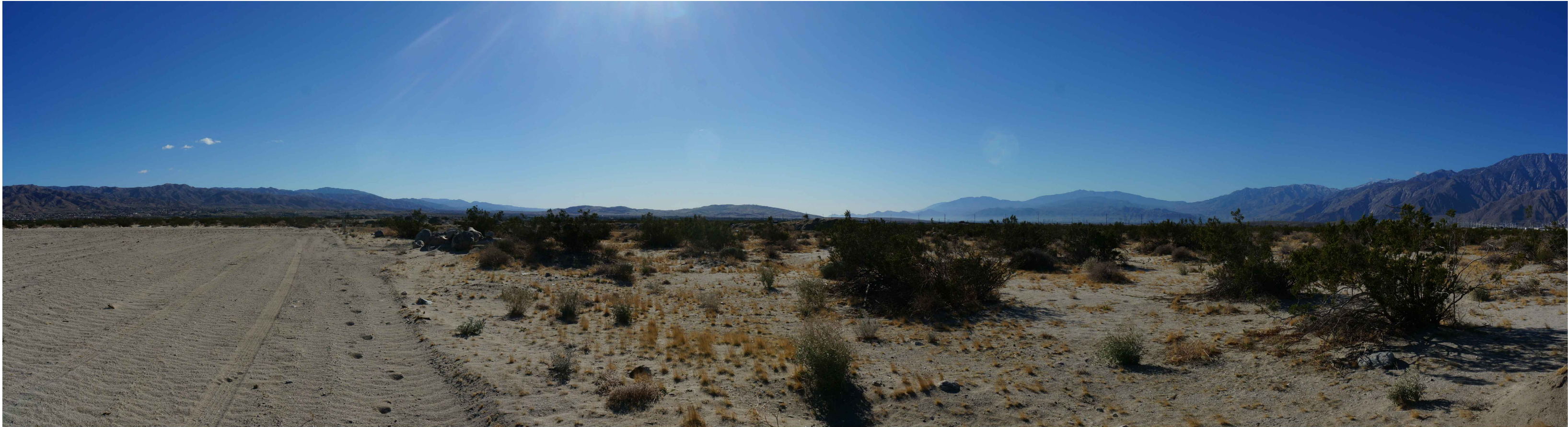
PHOTOGRAPH NO. 2 NORTH WEST CORNER