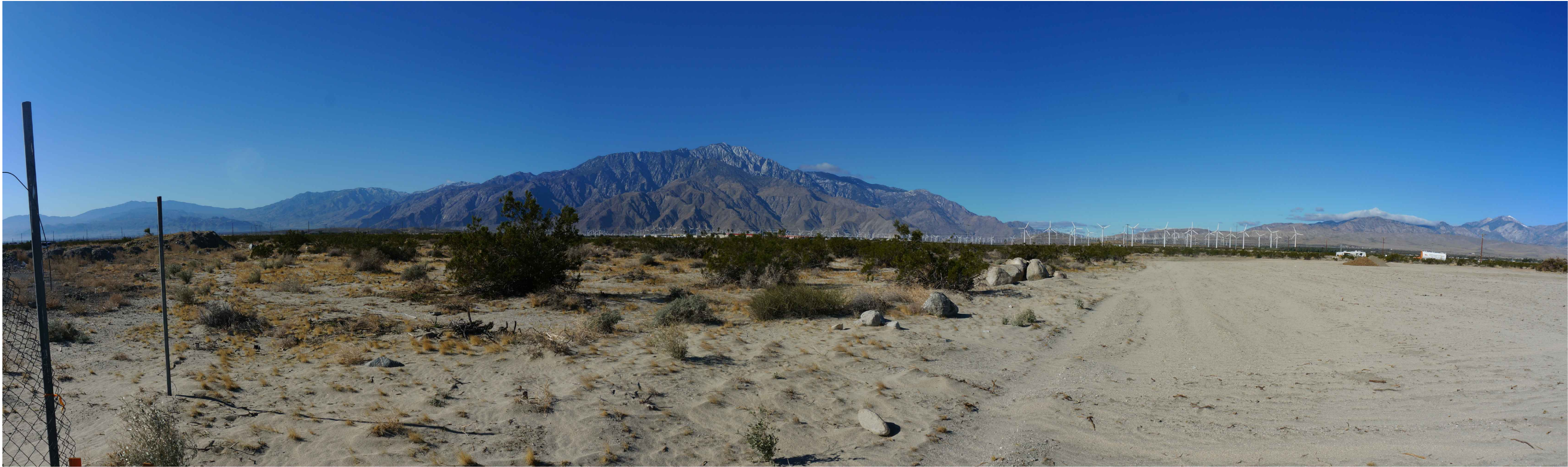
PHOTOGRAPH NO. 3 NORTH EAST CORNER