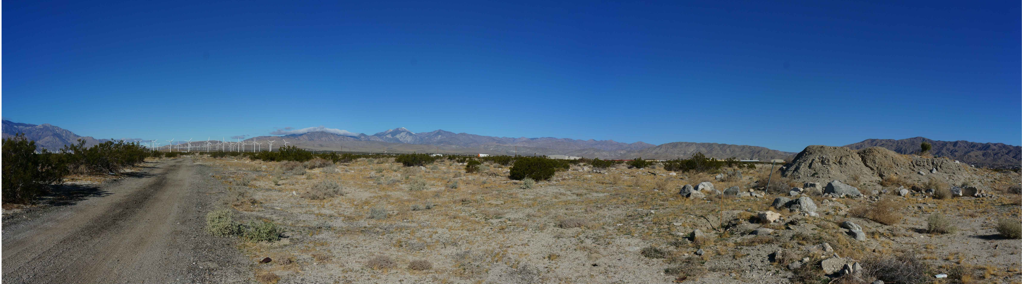
PHOTOGRAPH NO. 4 SOUTH EAST CORNER