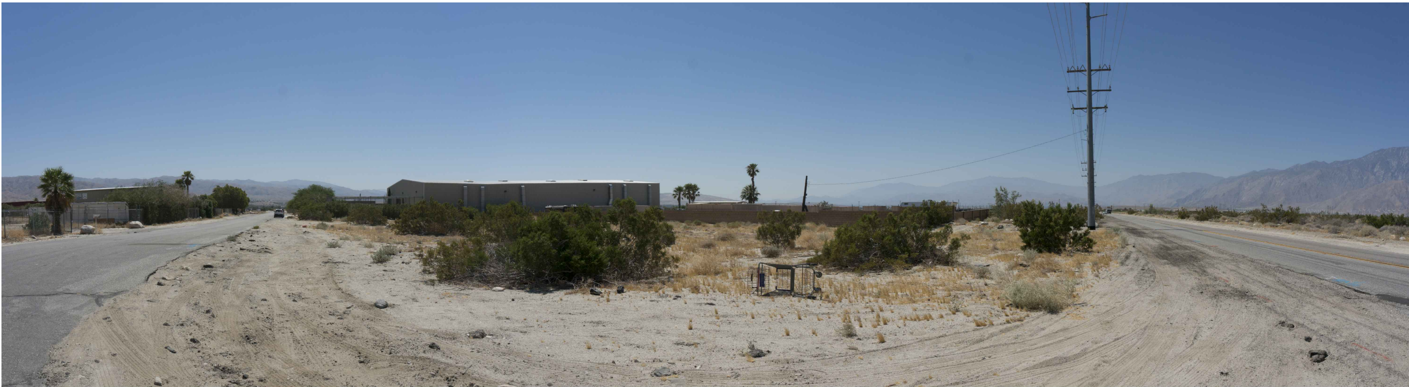
PHOTOGRAPH NO. 2