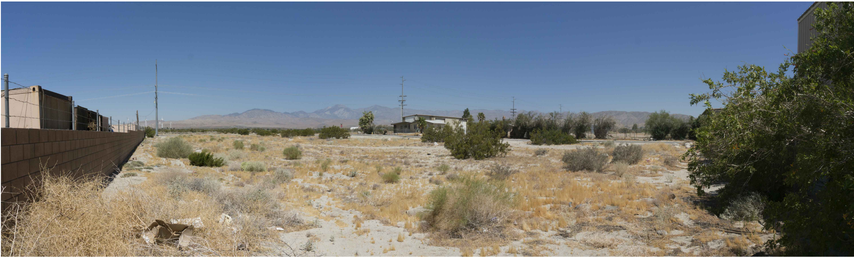
PHOTOGRAPH NO. 4