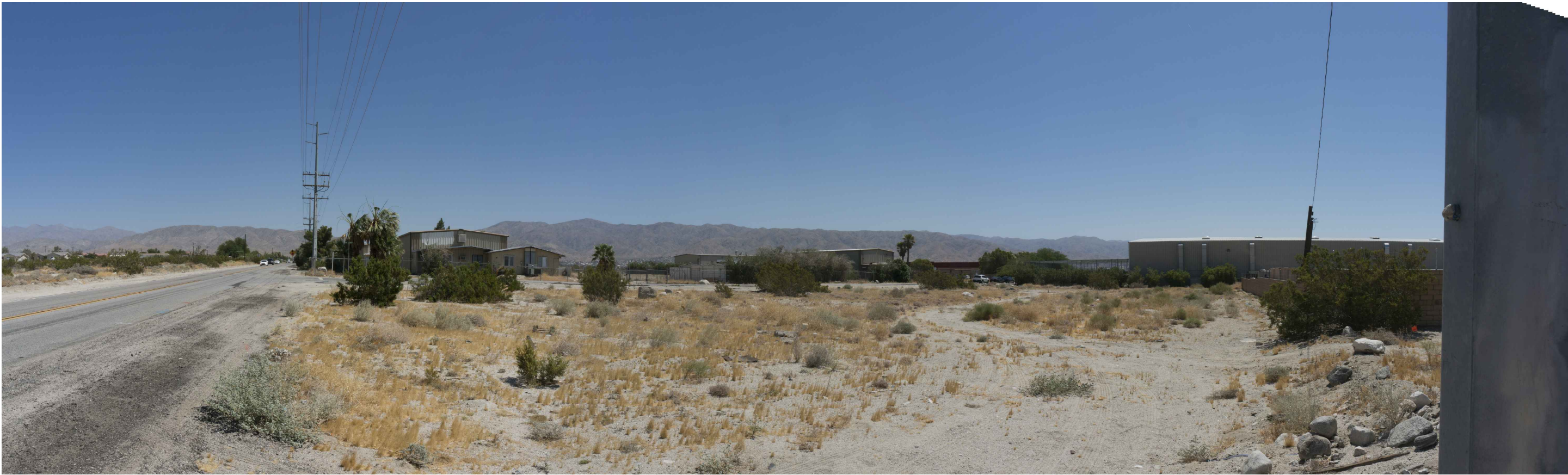
PHOTOGRAPH NO. 1