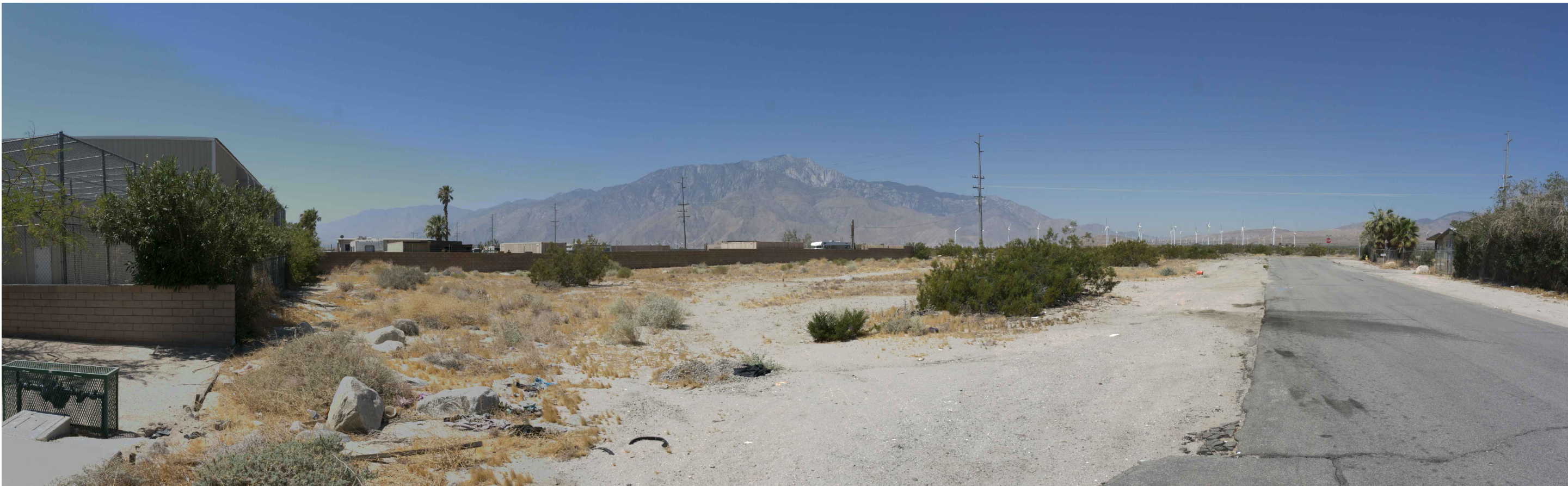
PHOTOGRAPH NO. 3