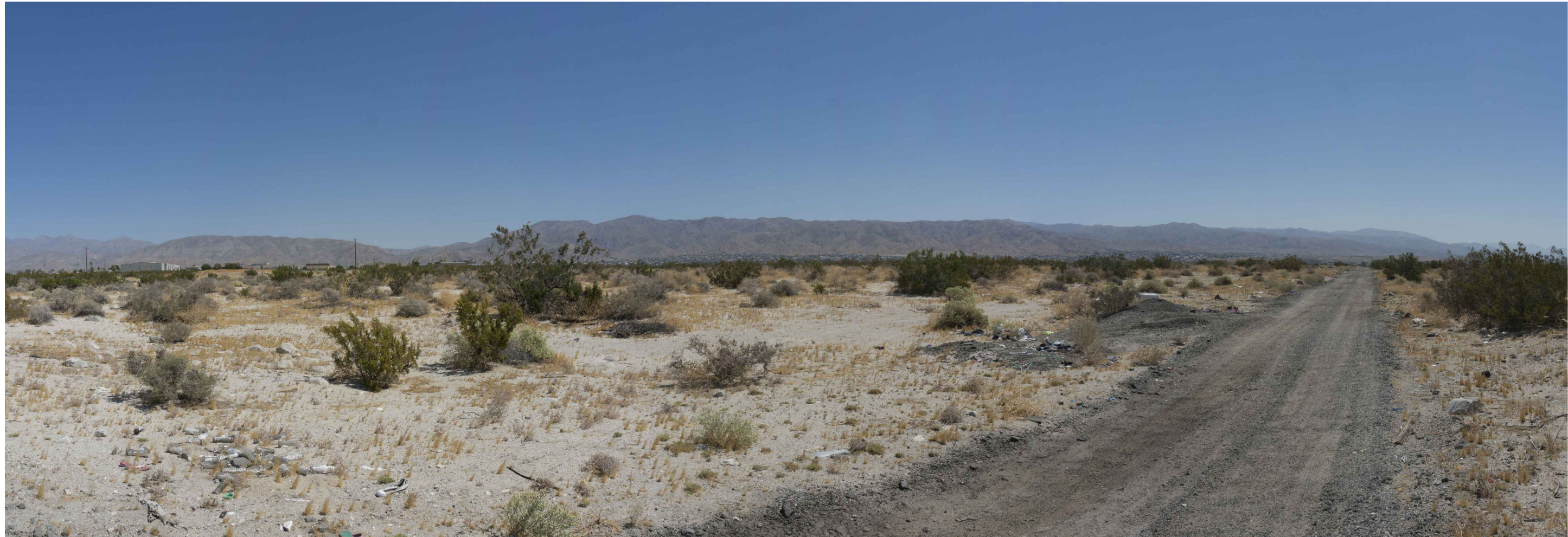
PHOTOGRAPH NO. 1 SOUTH WEST CORNER