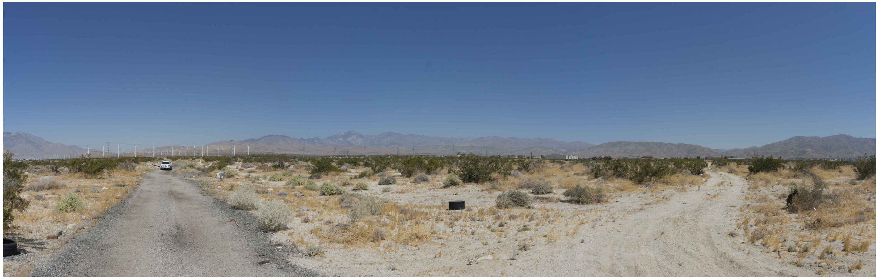
PHOTOGRAPH NO. 4 SOUTH EAST CORNER