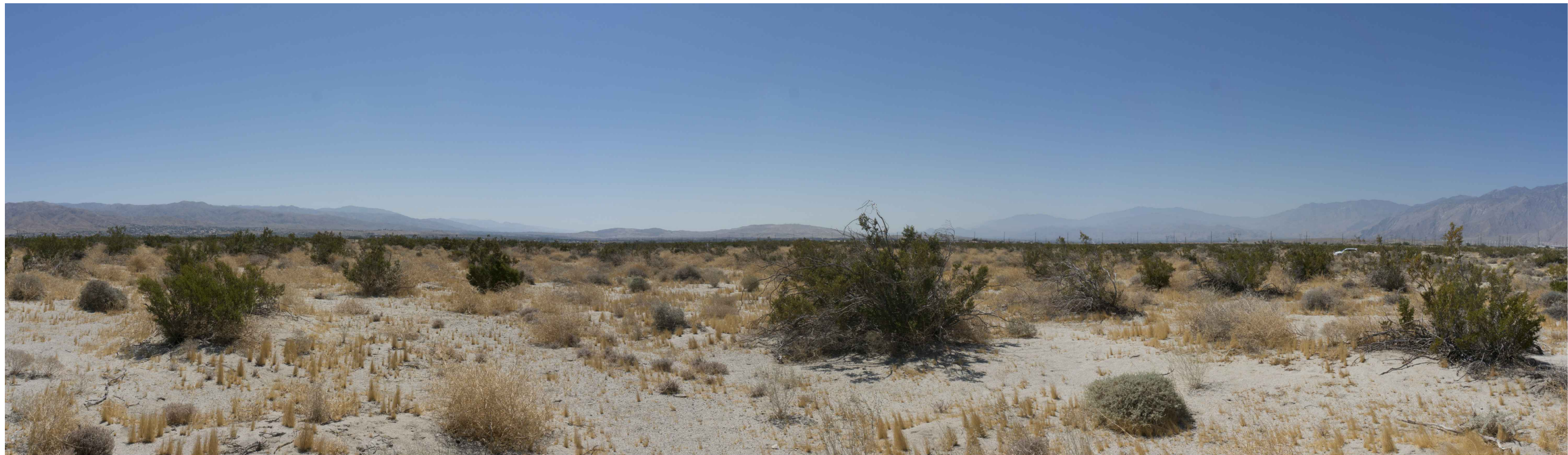
PHOTOGRAPH NO. 2 NORTH WEST CORNER