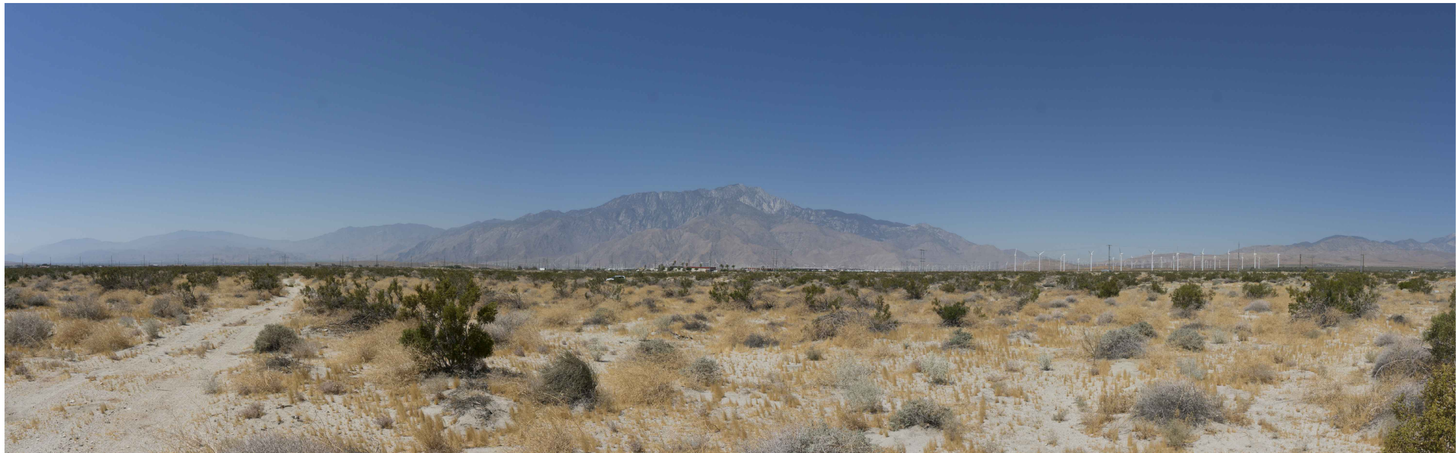
PHOTOGRAPH NO. 3 NORTH EAST CORNER