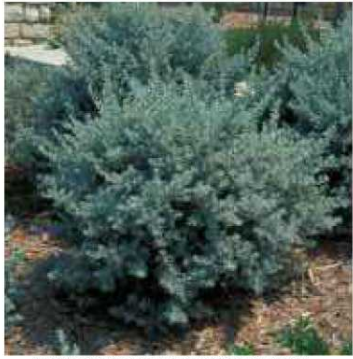
LEUCOPHYLLUM F. 'SILVER CLOUD'