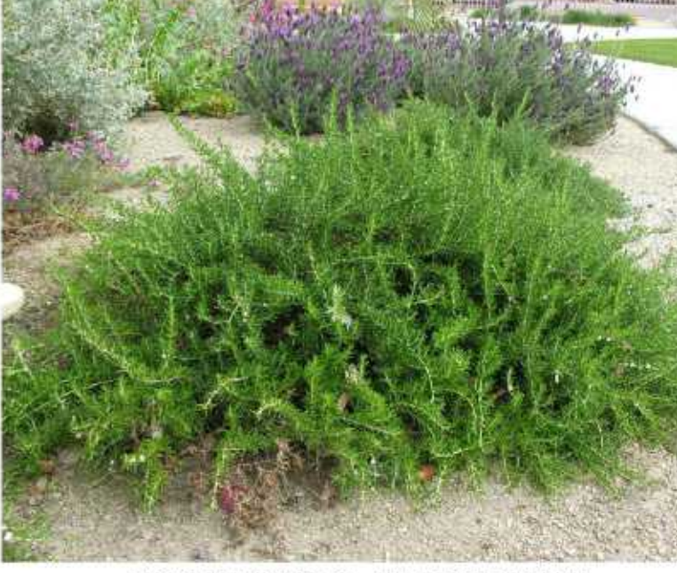
ROSMARINUS O. 'PROSTRATUS'