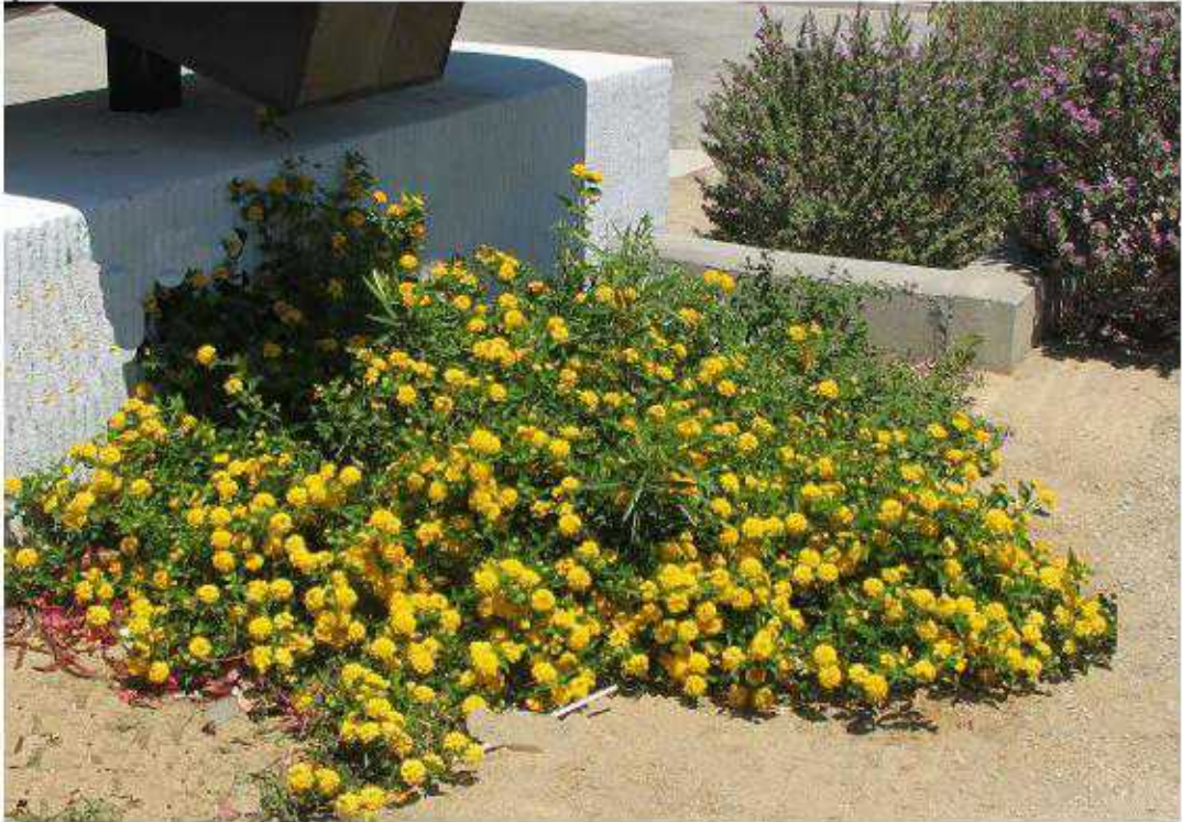
LANTANA 'NEW GOLD'