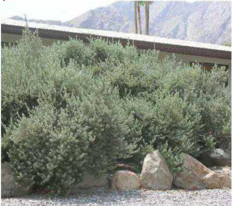
LEUCOPHYLLUM 'GRAY CLOUD'