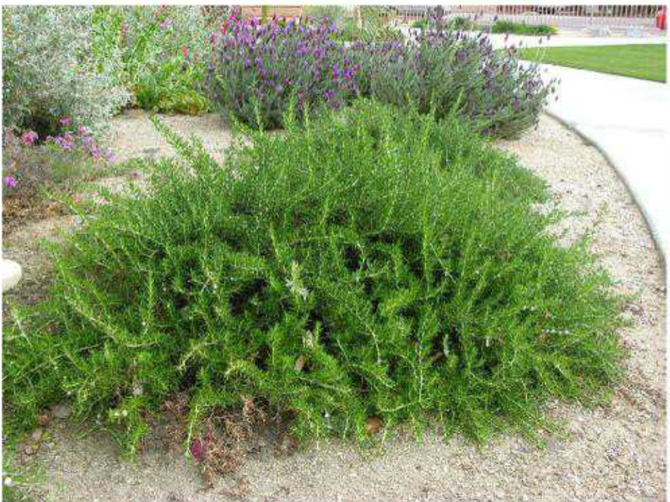
ROSMARINUS O. 'PROSTRATUS'