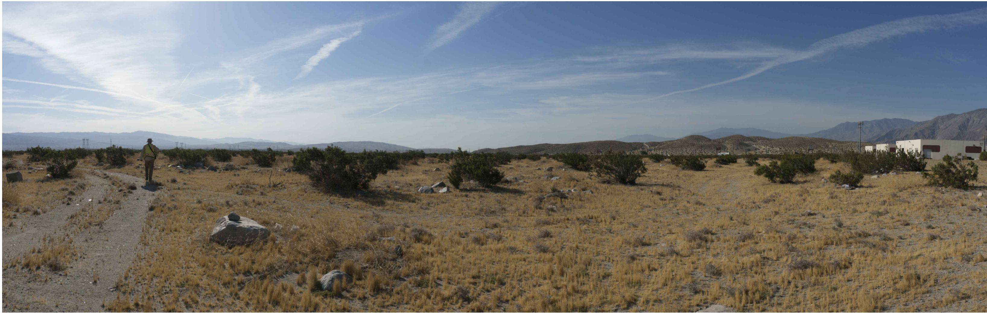
PHOTOGRAPH NO. 2: NORTH WEST CORNER