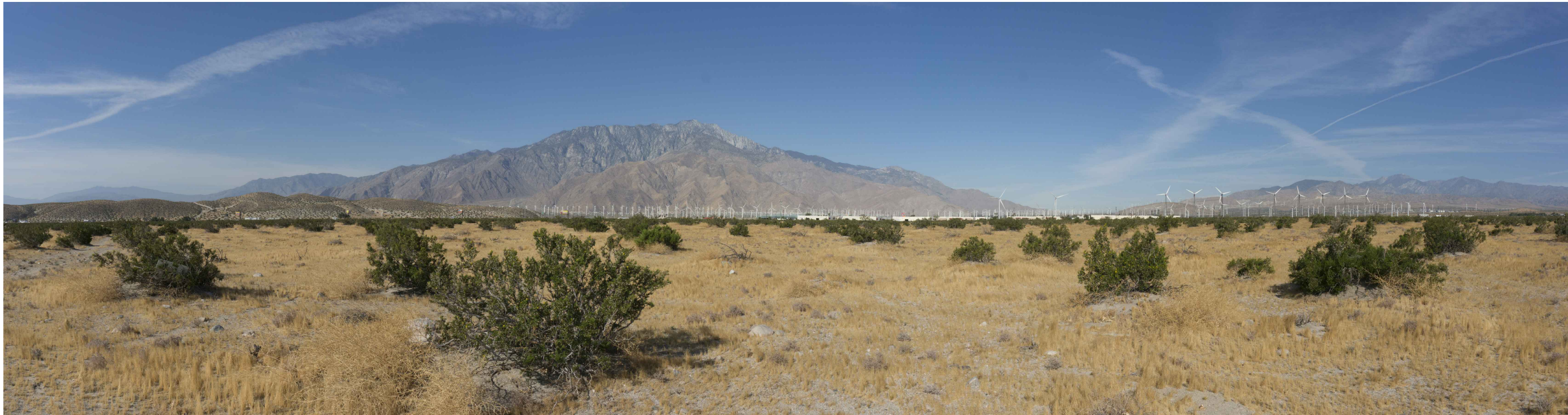
PHOTOGRAPH NO. 3: NORTH EAST CORNER