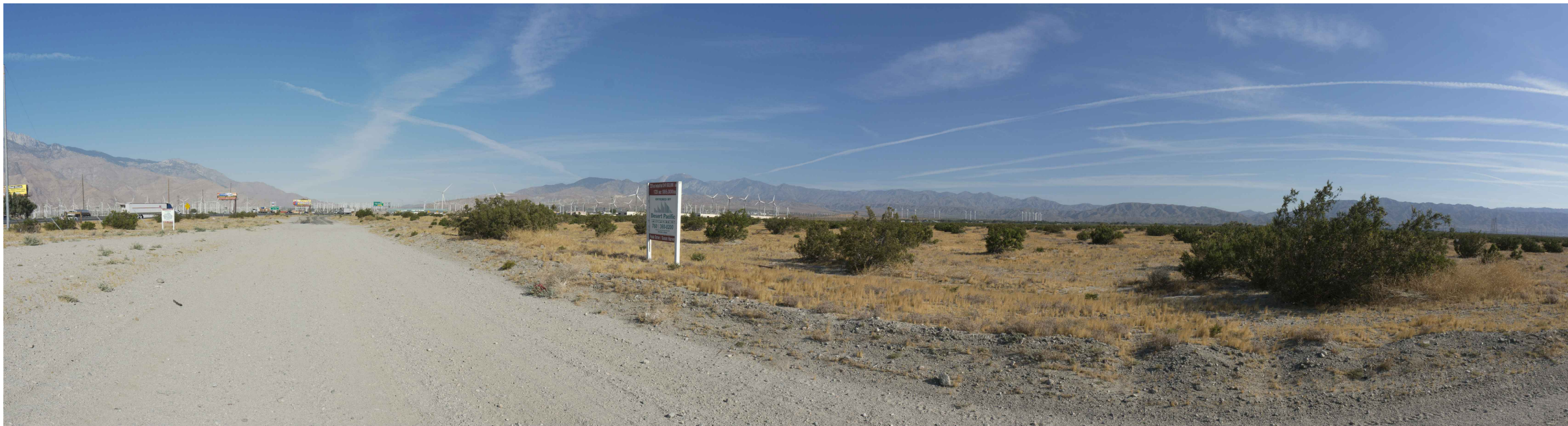
PHOTOGRAPH NO. 4: SOUTH EAST CORNER