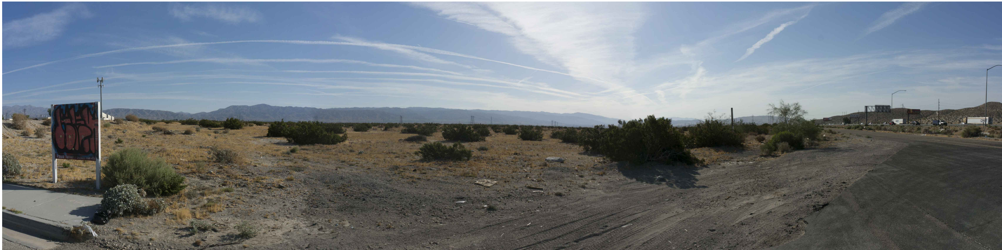
PHOTOGRAPH NO. 1: SOUTH WEST CORNER