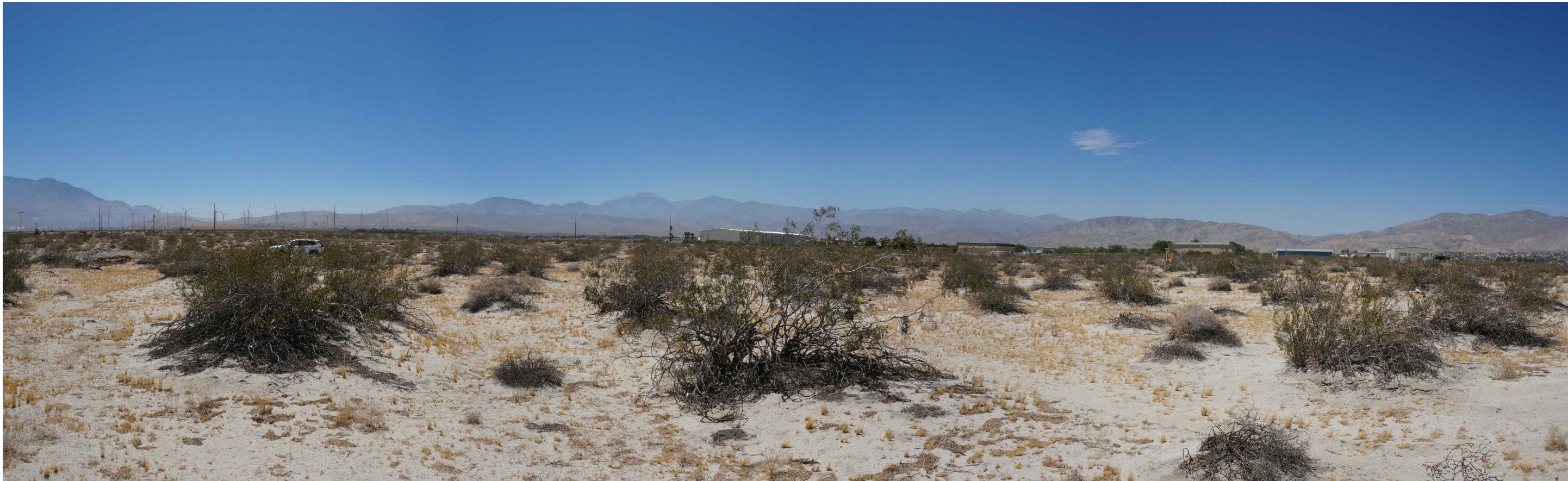
PHOTOGRAPH NO. 3: SOUTH EAST CORNER