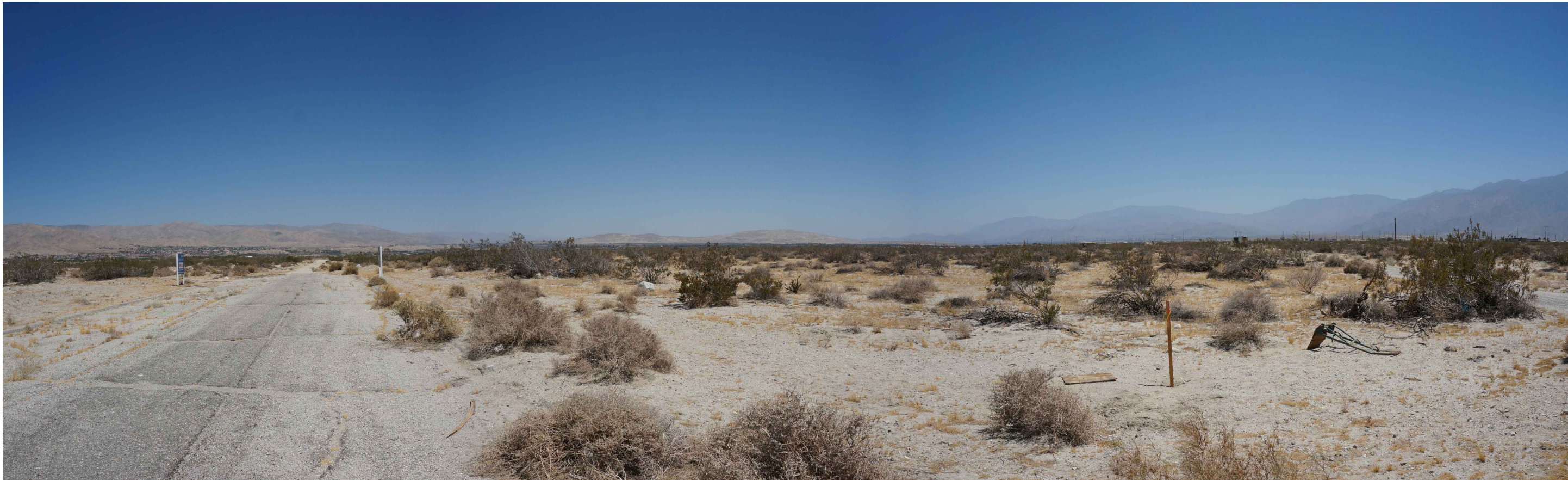
PHOTOGRAPH NO. 1: NORTH WEST CORNER