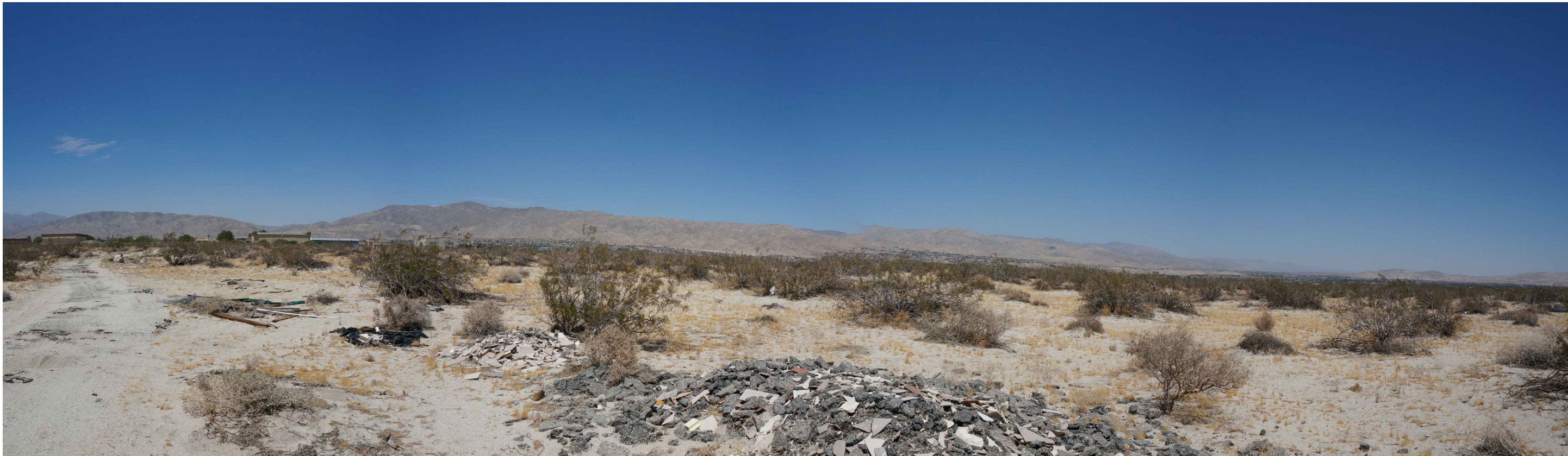
PHOTOGRAPH NO. 4: SOUTH WEST CORNER