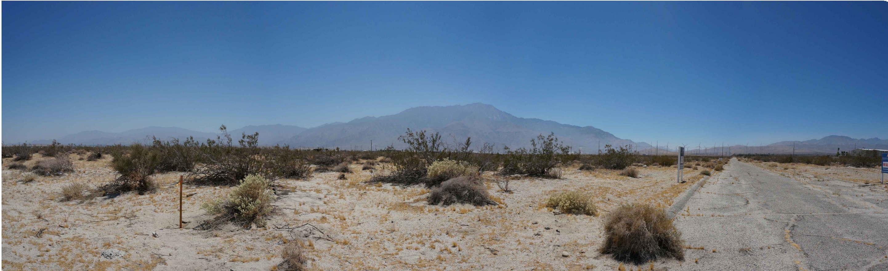
PHOTOGRAPH NO. 2: NORTH EAST CORNER