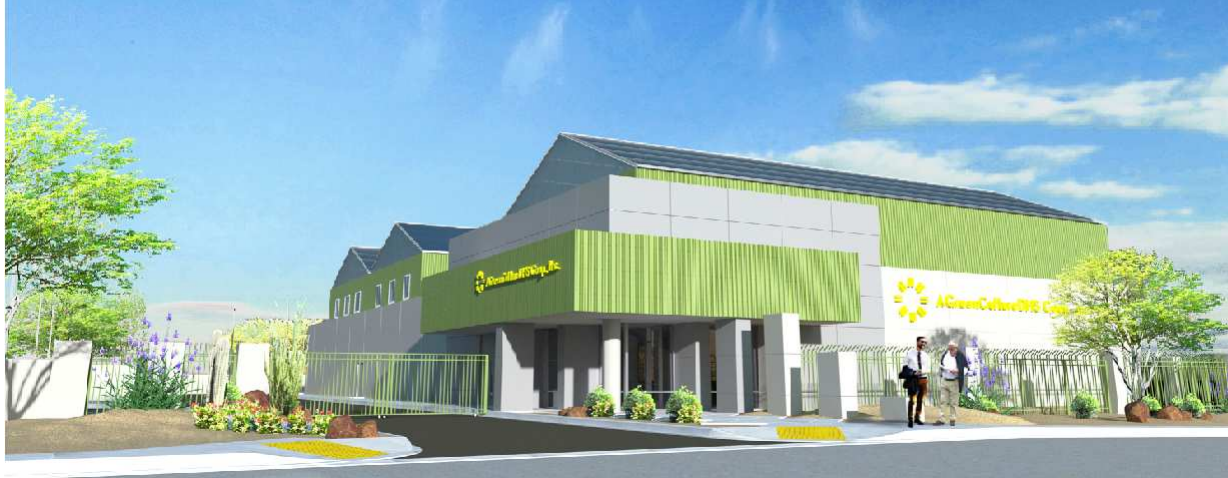
View from Little Morongo Ave (Looking south east)

elements in the style of contemporary desert architecture. Contrasting accent colors will bring out and visually enhance the architectural features and elements. The overall architectural character will be that of an attractive, well-maintained industrial building. Exhibit 5, Architectural Floor Plan shows the typical interior layout of the proposed buildings while Exhibit 4, Building Elevations depicts the exterior architectural treatments to be used. Site perimeter will be enclosed with wrought-iron or tubular steel fencing to enhance visuals and secure perimeter.