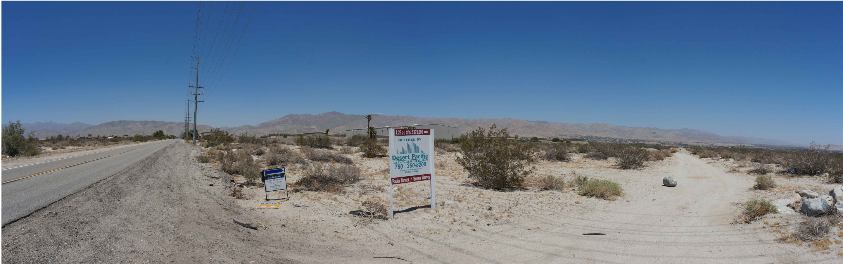
PHOTOGRAPH NO. 4: SOUTH WEST CORNER