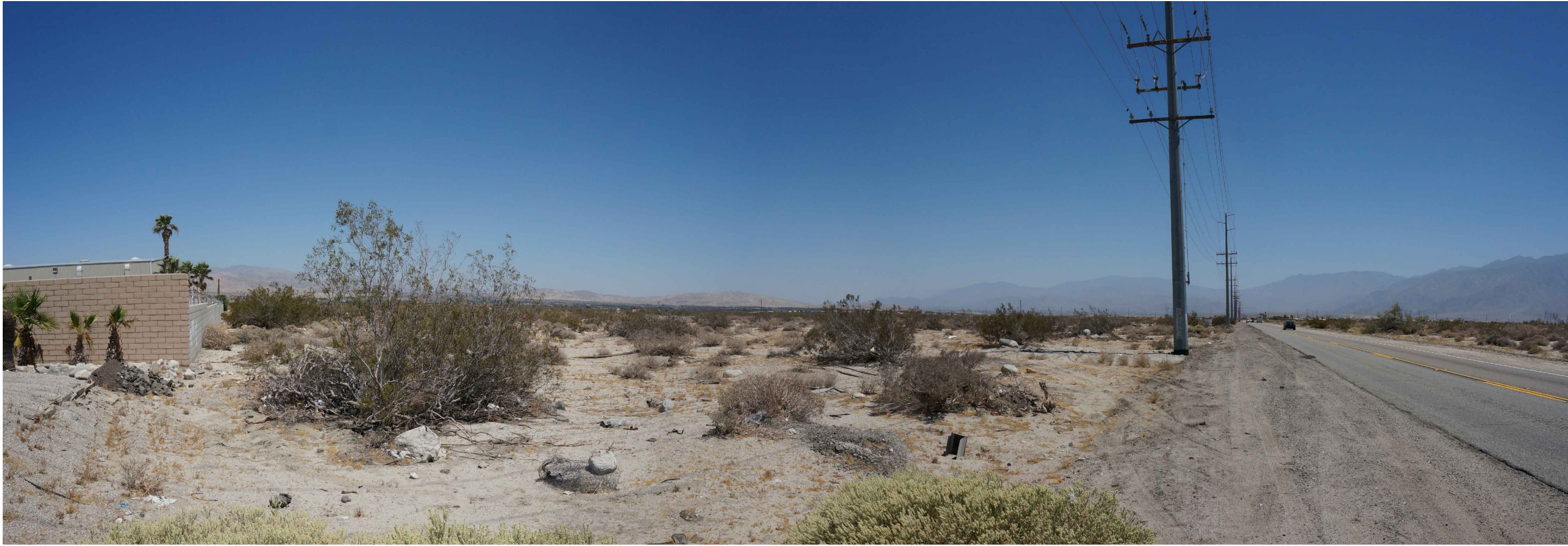
PHOTOGRAPH NO. 1: NORTH WEST CORNER