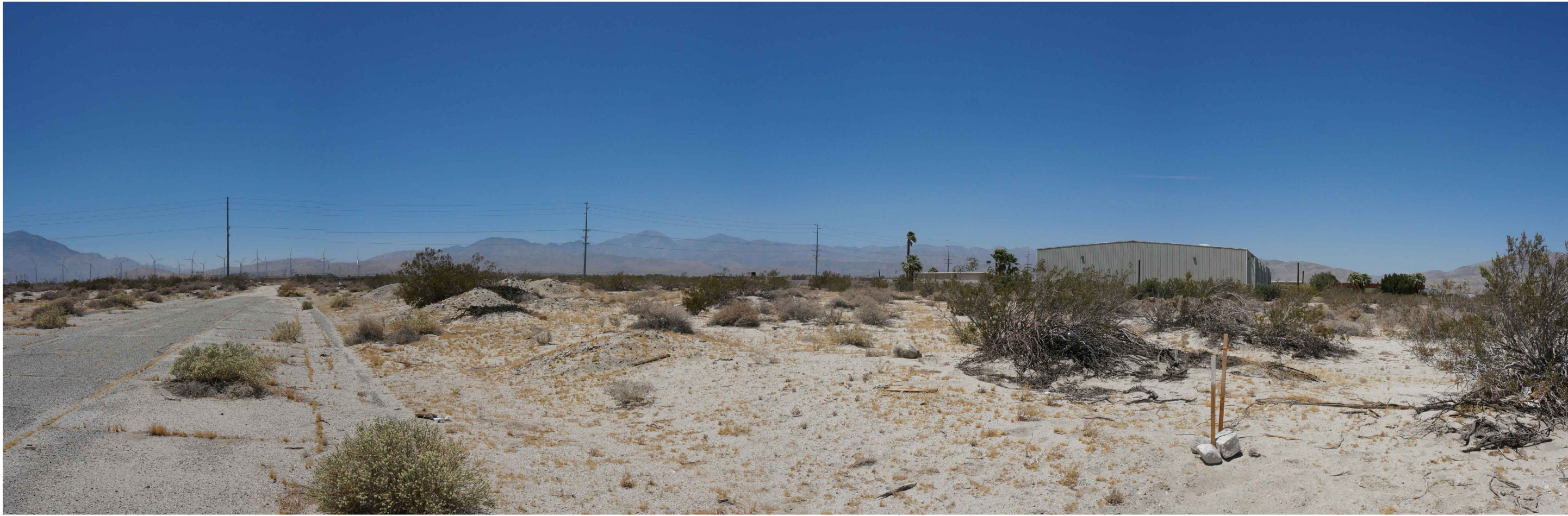
PHOTOGRAPH NO. 3: SOUTH EAST CORNER