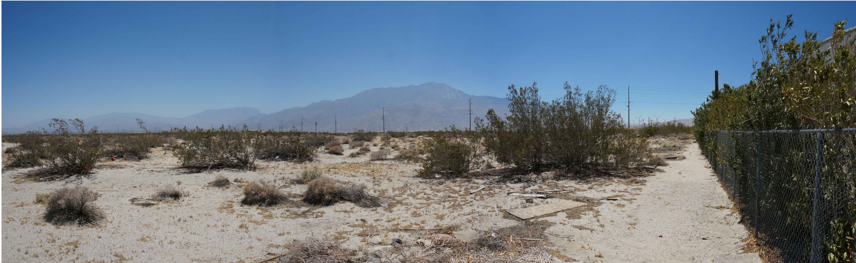
PHOTOGRAPH NO. 2: NORTH EAST CORNER