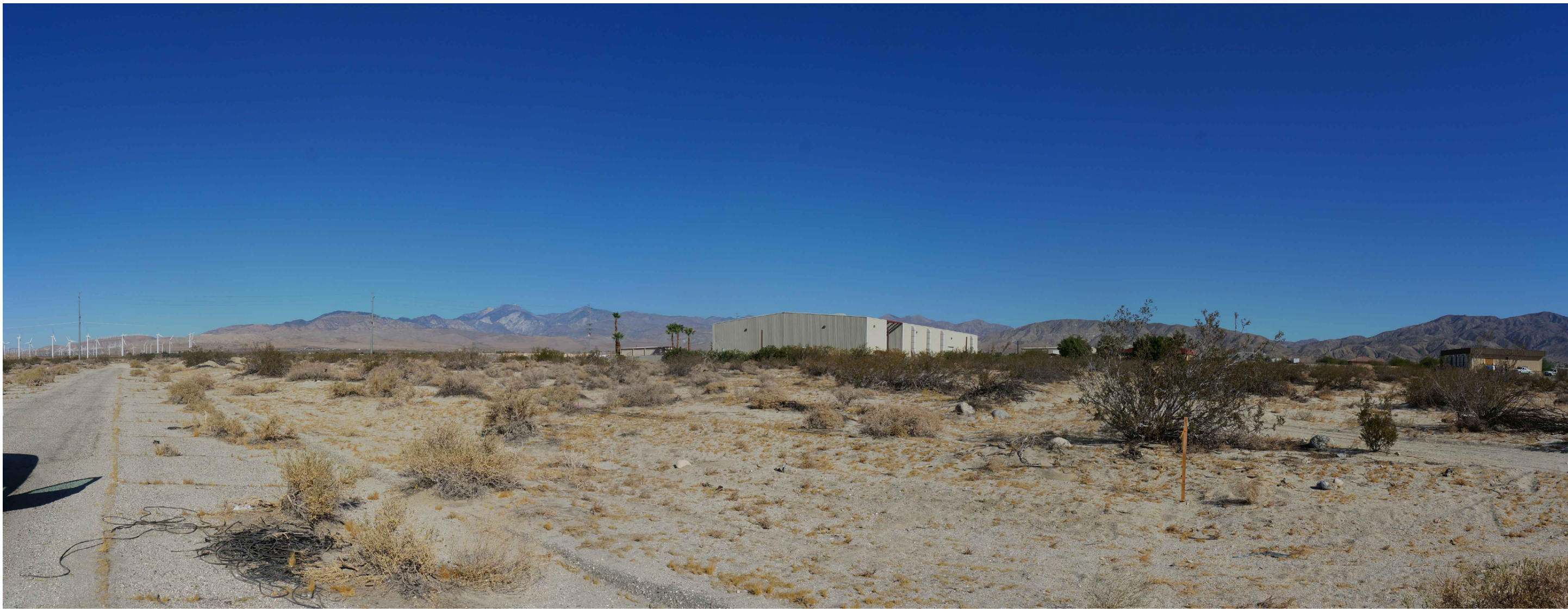
PHOTOGRAPH NO. 4: SOUTH EAST CORNER