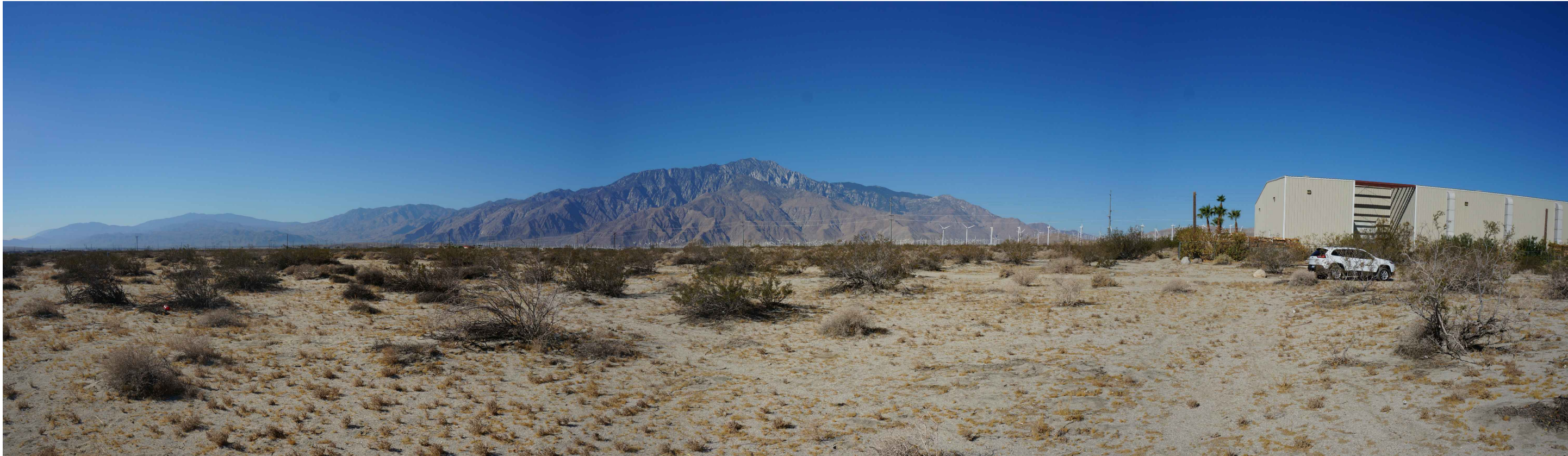
PHOTOGRAPH NO. 3: NORTH EAST CORNER