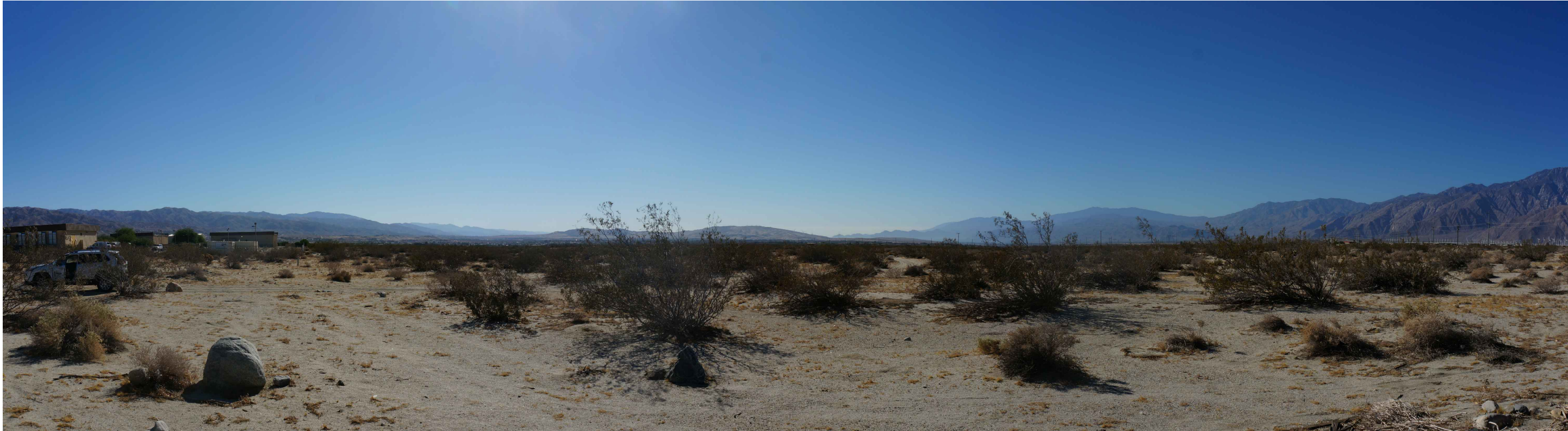
PHOTOGRAPH NO. 2: NORTH WEST CORNER