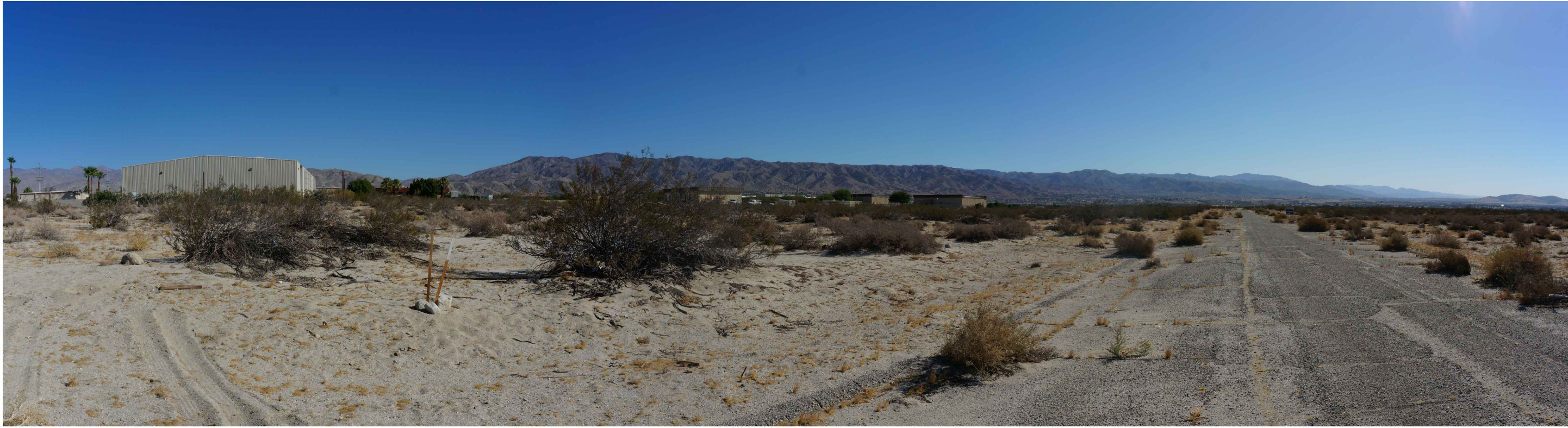
PHOTOGRAPH NO. 1: SOUTH WEST CORNER