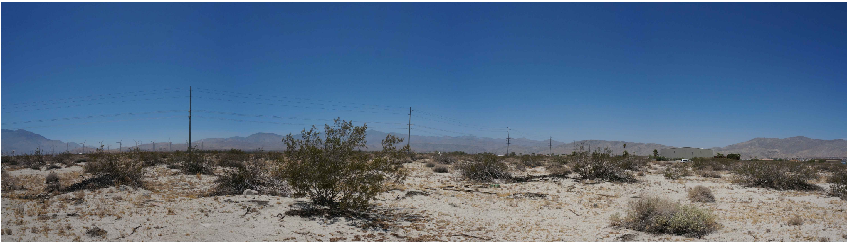
PHOTOGRAPH NO. 3: SOUTH EAST CORNER