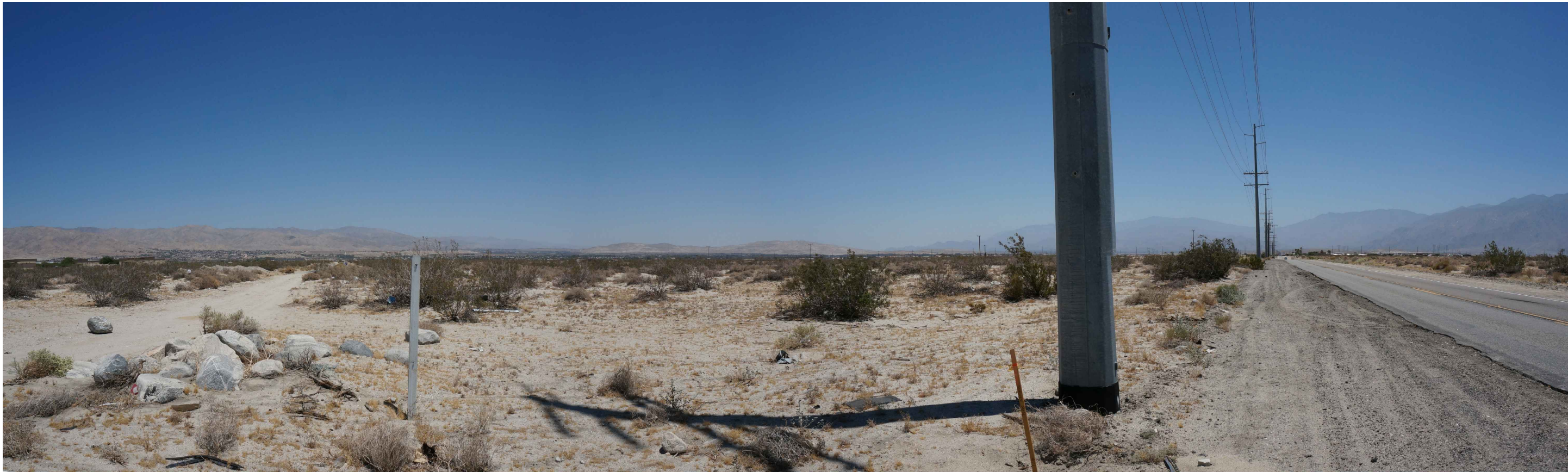
PHOTOGRAPH NO. 1: NORTH WEST CORNER