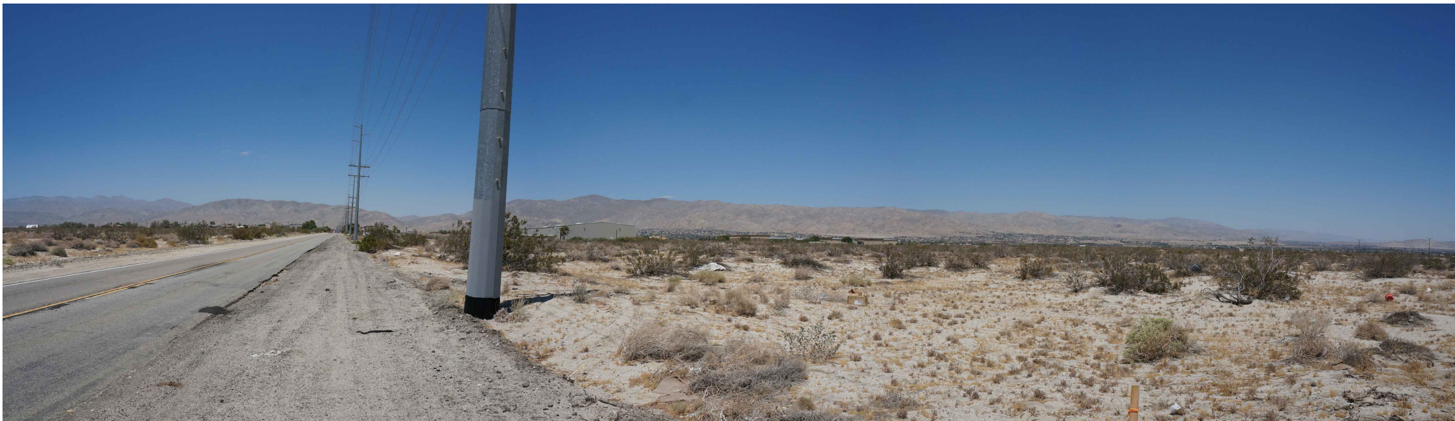
PHOTOGRAPH NO. 4: SOUTH WEST CORNER