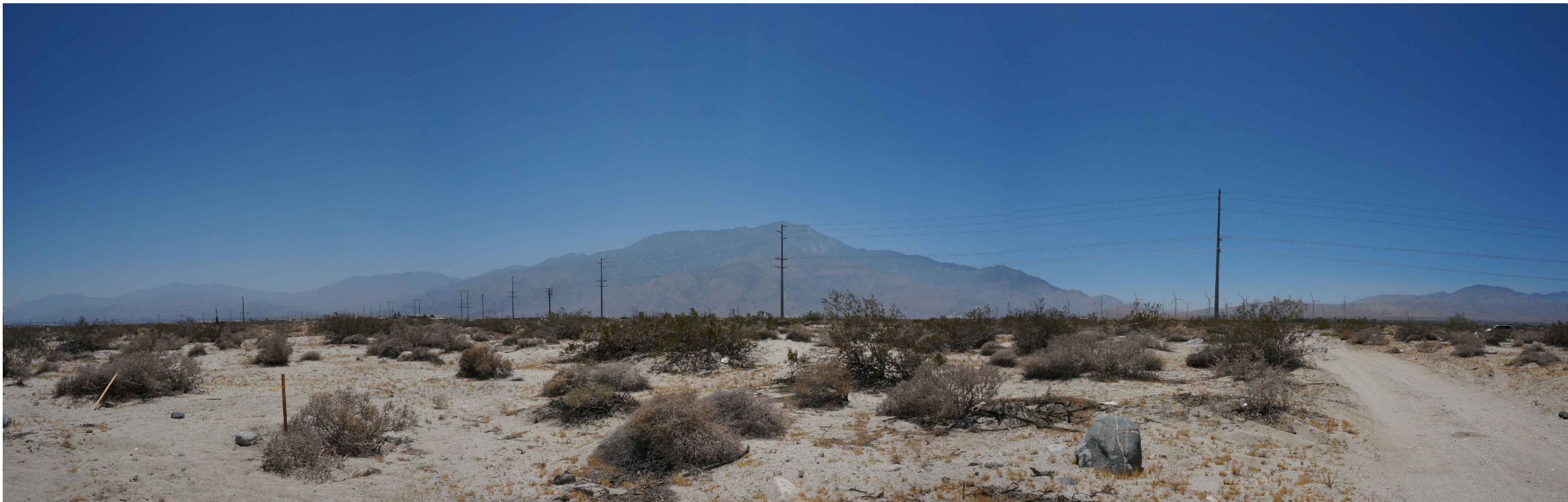
PHOTOGRAPH NO. 2: NORTH EAST CORNER