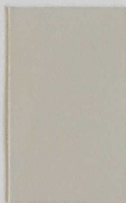
Dunn Edwards Muslin # DE6227