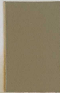
Dunn Edwards Calico Rock # DE6229

Pre-Engineered Greenhouse Exhaust Fans with Light Traps per Greenhouse Manufacturer