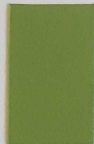
Dunn Edwards Ivy Enchantment # DE5571

20/30 Sand Fin. Plaster with Cntrl. Joints to be painted with 'Dunn Edwards' Muslin # DE6227 and Calico Rock # DE6229 or App. Equal