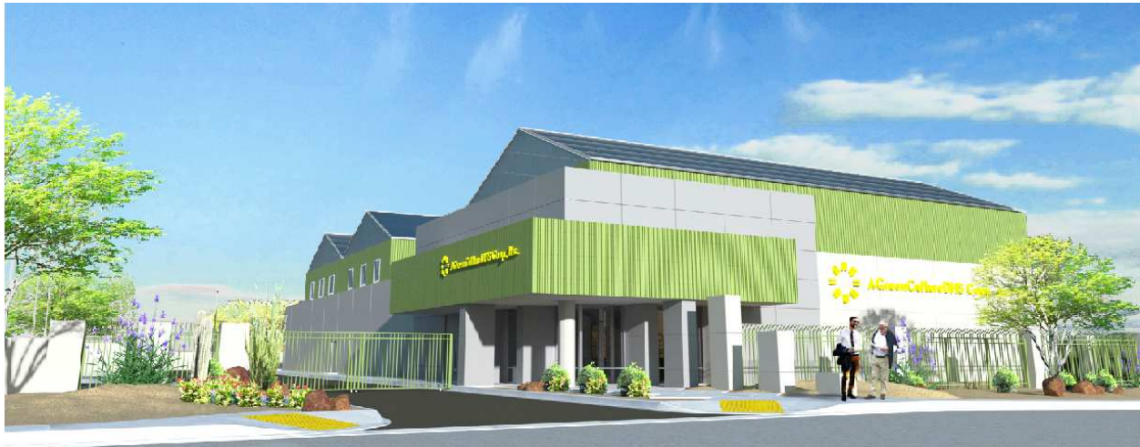
View from Little Morongo Ave (Looking south east)

Landscaping: Landscaping is proposed around the entire perimeter of the site, which includes substantial plantings along the street frontage and the parking area. Landscaping has been designed to balance aesthetic, water use and security objectives. Along Little Morongo Road and 15th Ave, landscaping will consist of Mexican Fan Palms, Mulgas, and Desert Museum Palo Verdes along with low level plantings and tubular steel/wrought iron fencing to visually enhance, protect and blend the cultivation facility into its surroundings while also promoting visibility by law enforcement vehicles from the street.