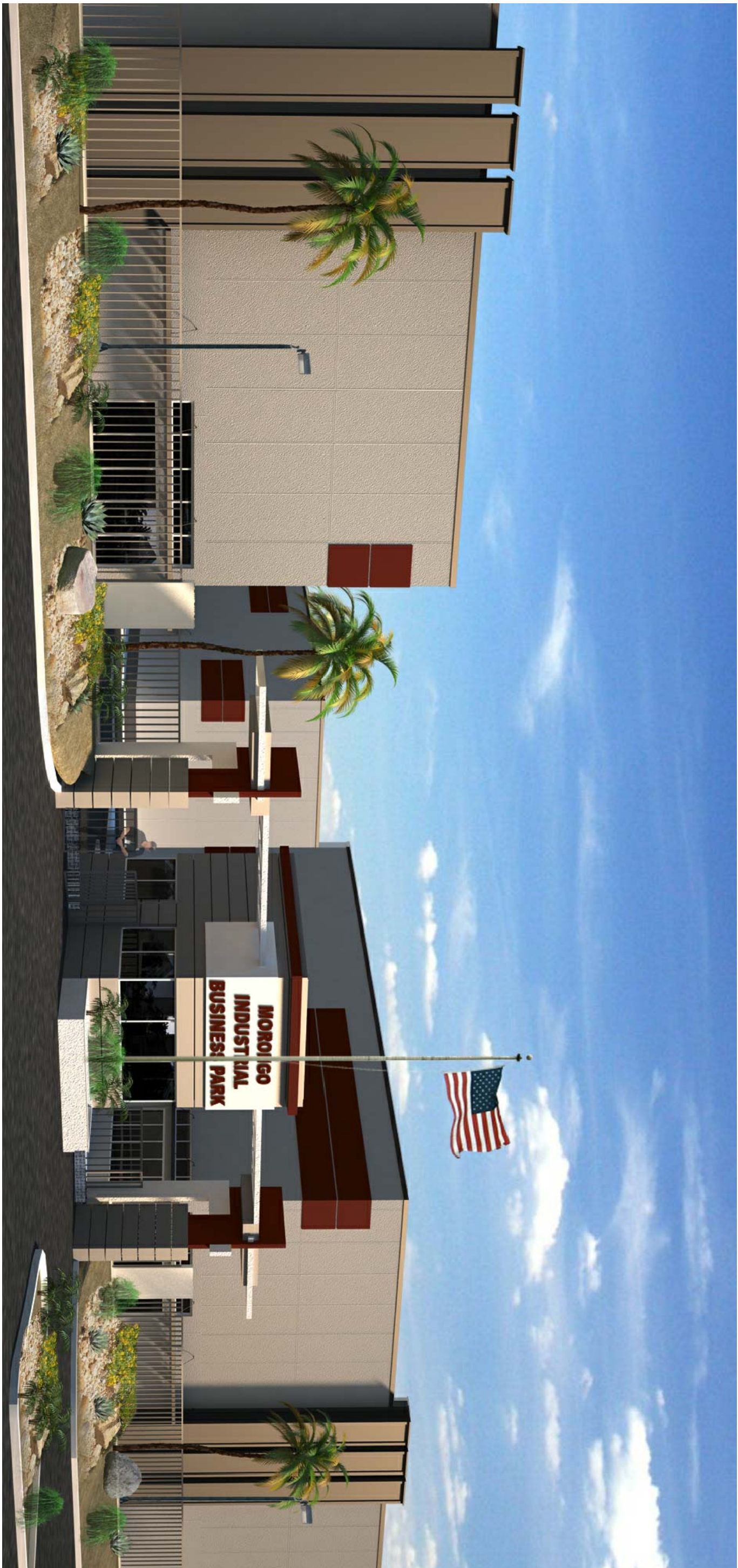
2 GUARD HOUSE VIEW