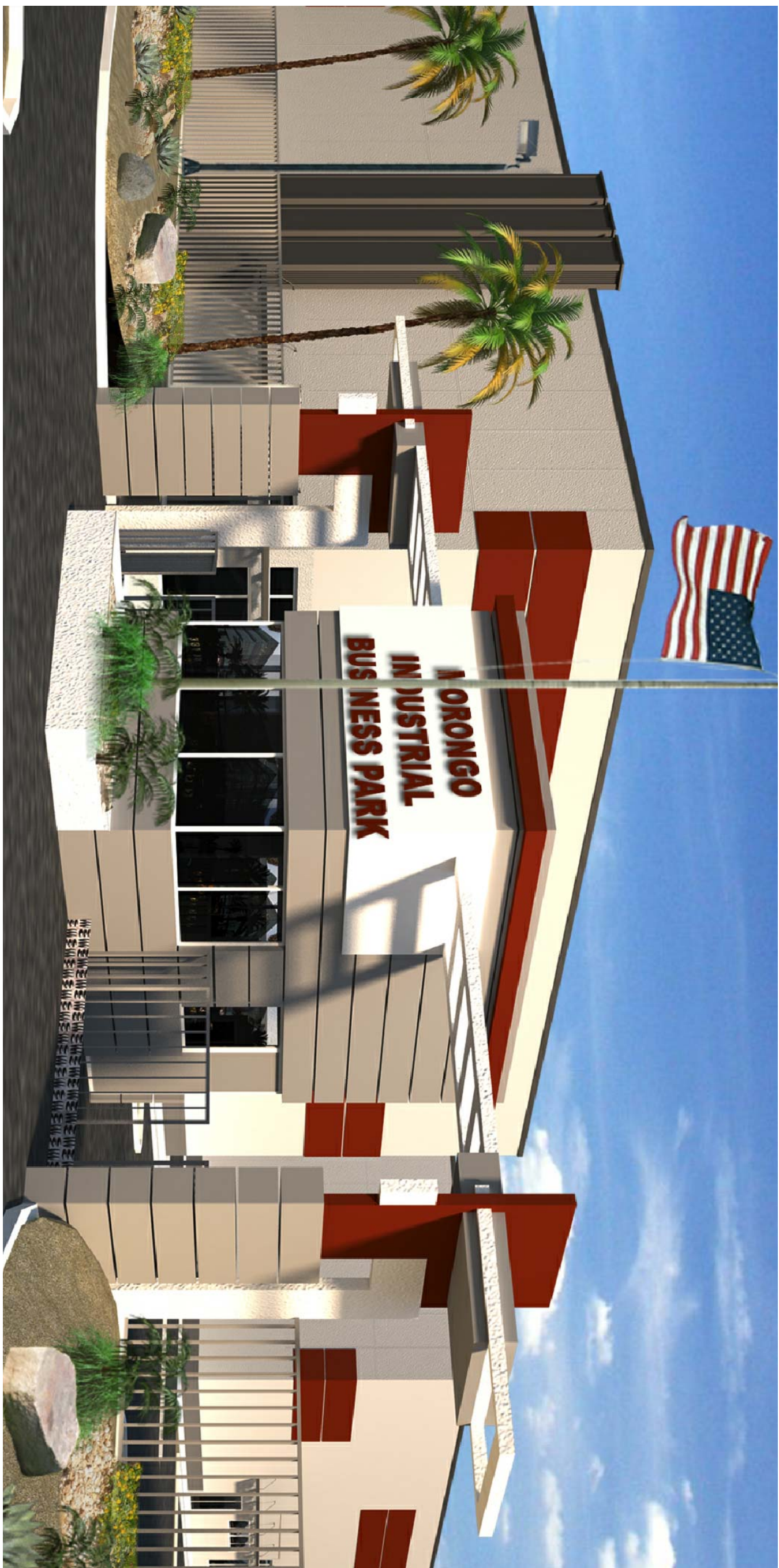
2 ENTRY- GUARD HOUSE VIEW