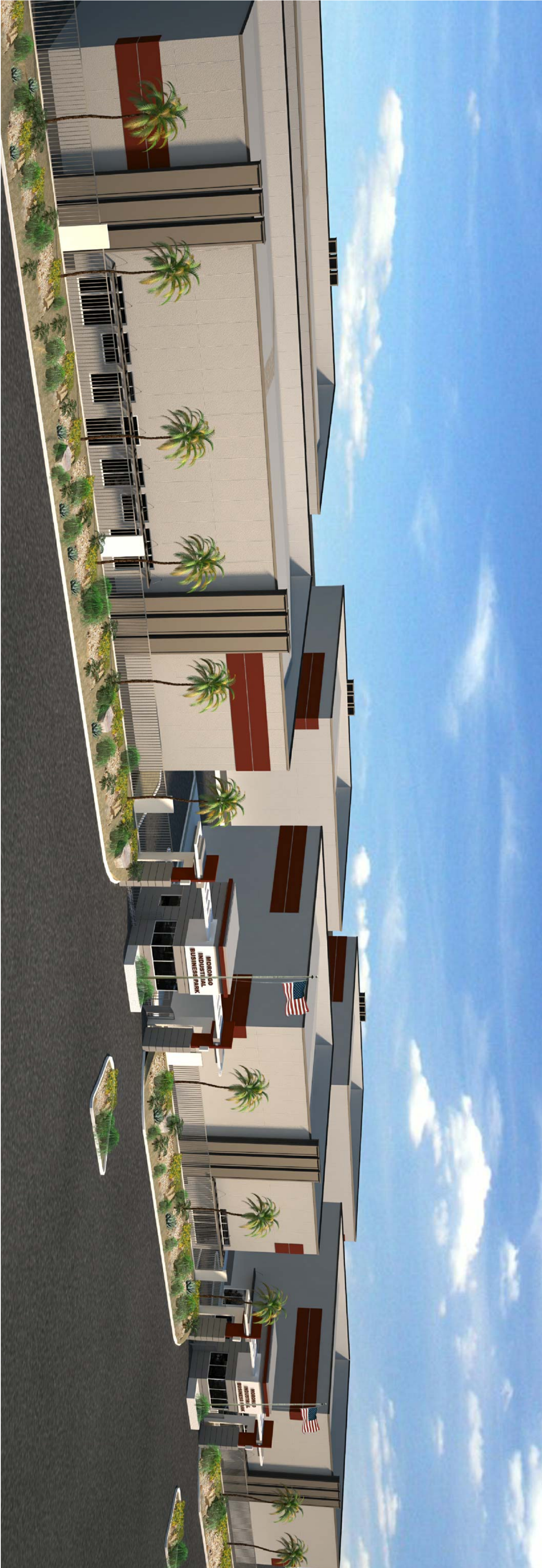
2 BIRDS EYE VIEW